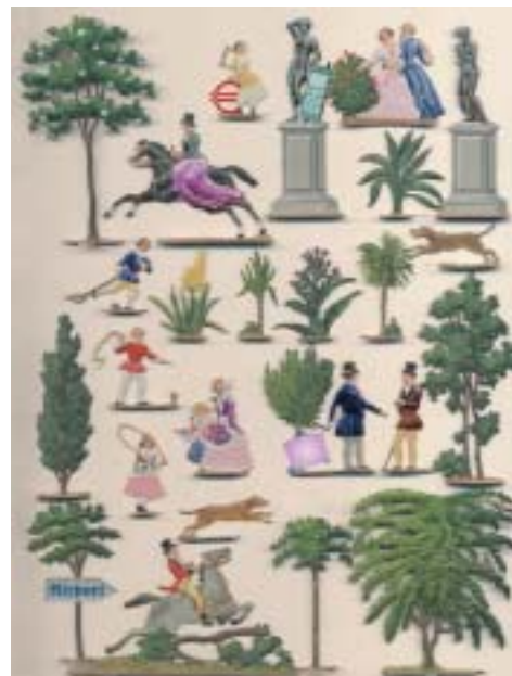
"Promenade around 1850" (formerly Söhlke collection)

There are always some deviations from these standards on the market and particularly in the case of the larger size brushes this will be reflected in remarkable price differences. Never buy a brush size 'blind', check, for example, whether size 12 compares with the size reproduced in this catalogue.